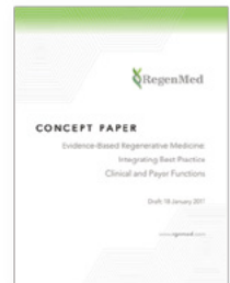
Concept Paper: Regenerative Medicine and Payors