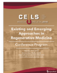
Program Book: 2016 CELLS Conference in Amsterdam